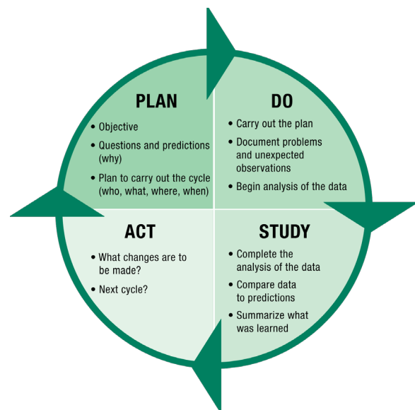
Figure 1. Steps in a Plan-Do-Study-Act cycle

Testing on a small-scale means trying out the change idea on a couple of patients or for a specific, short time period, such as one shift. Teams should ask themselves “what is the smallest scale I can try this out on?” and then do that test as soon as possible. This will give the teams immediate feedback on the idea: what works, what doesn’t work, and what problems or barriers need to be fixed. As they find a solution to any barriers encountered, teams can test the idea again on a larger scale. For example, perhaps they test an idea to reorganize patient flow with 5 patients the next day. If that works well, they can move to trying it with all patients for one shift, then for one week, and eventually make it a permanent part of the facility’s operation.