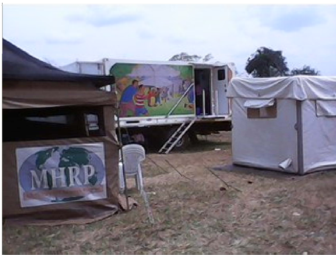
The mobile van clinic setup during an outreach in Baale sub county in January 2014.

USAID ASSIST will continue to support the site through monthly coaching visits, mentorships, and technical support and review meetings (learning sessions) to help them achieve their improvement objectives. USAID ASSIST will also scale up the learnt best practices to other health facilities where SMC quality improvement is still a challenge.